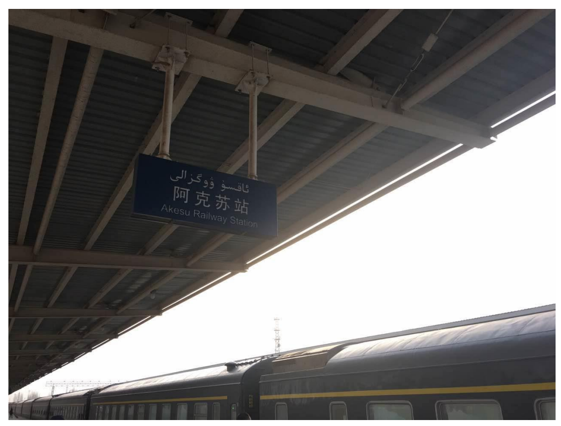
Fig.6 the endpoint of the test: Akesu Railway Station