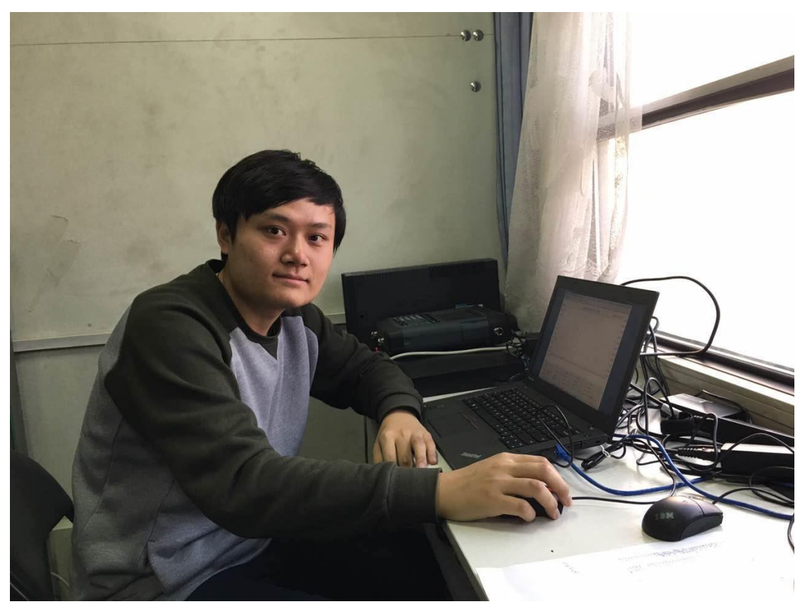
Fig. 1 photo with the whole FST system