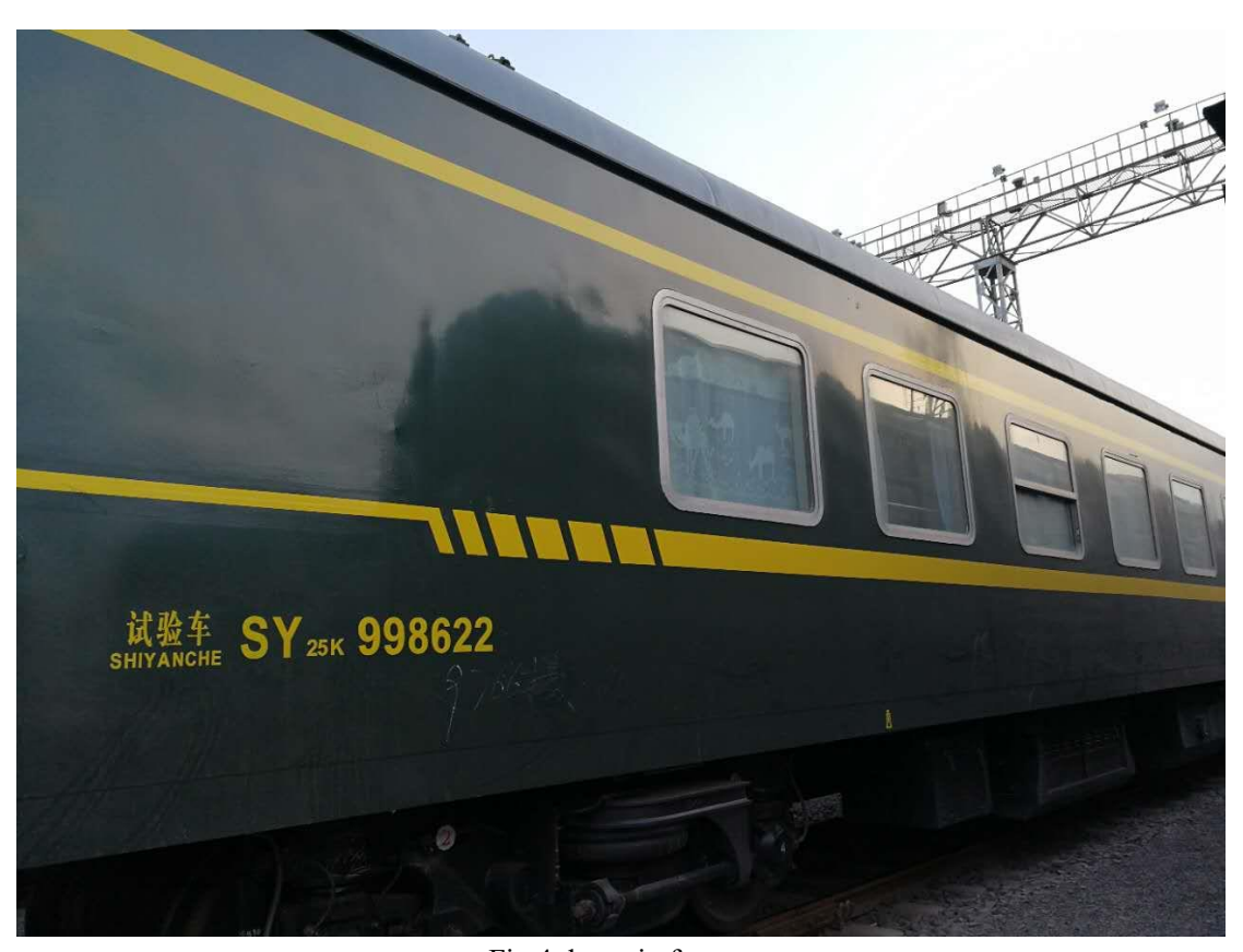
Fig.4 the train for test